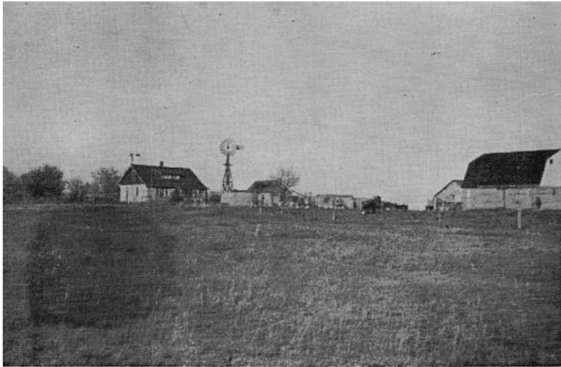
— 1940 —