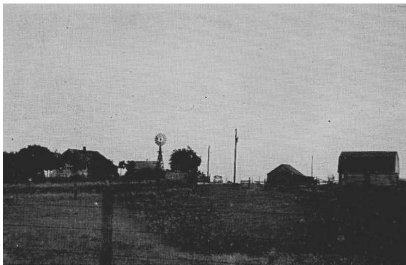
— 1950 —