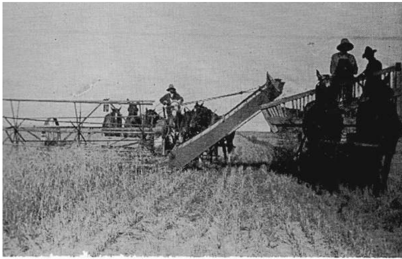
— Harvesting in the "30's" —